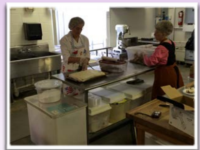
Photos from the Kitchen Fall Camp Meeting 2014