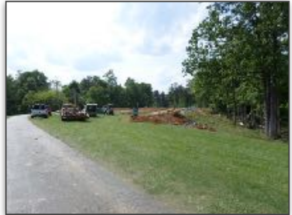
The RV Park is expected to be completed for the Fall Camp Meeting. Rain during the May Work Week prohibited us from completing it in time for the June Camp Meeting.

Another work week has come and gone with this one being the biggest one yet! It has been said there was between 400-500 volunteers there and, oh, what a week it was. There were so many works that they divided them up into groups and a lot of work got done. One group of men worked on the new RV Park, which is located up by the cemetery. The plan is to have spaces for 30 campers. We watched as they laid sewer lines, water lines, and electrical lines. I was amazed at all the “stuff” it takes to do a job like this. There were huge piles of sewer pipe and water lines, and rolls of electrical wire. Another group was working across Mt Elmira Road doing the same thing; laying sewer lines, water lines and running electrical wires to prepare the land for cabins.