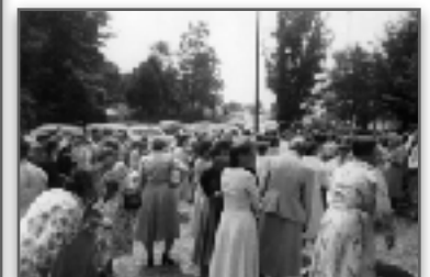
The "prayer line" exiting out the side door.