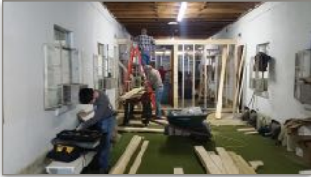
A few photos from WORK WEEK 2016...