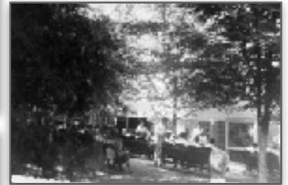
The theater seats now located in the balcony have been around a long time.